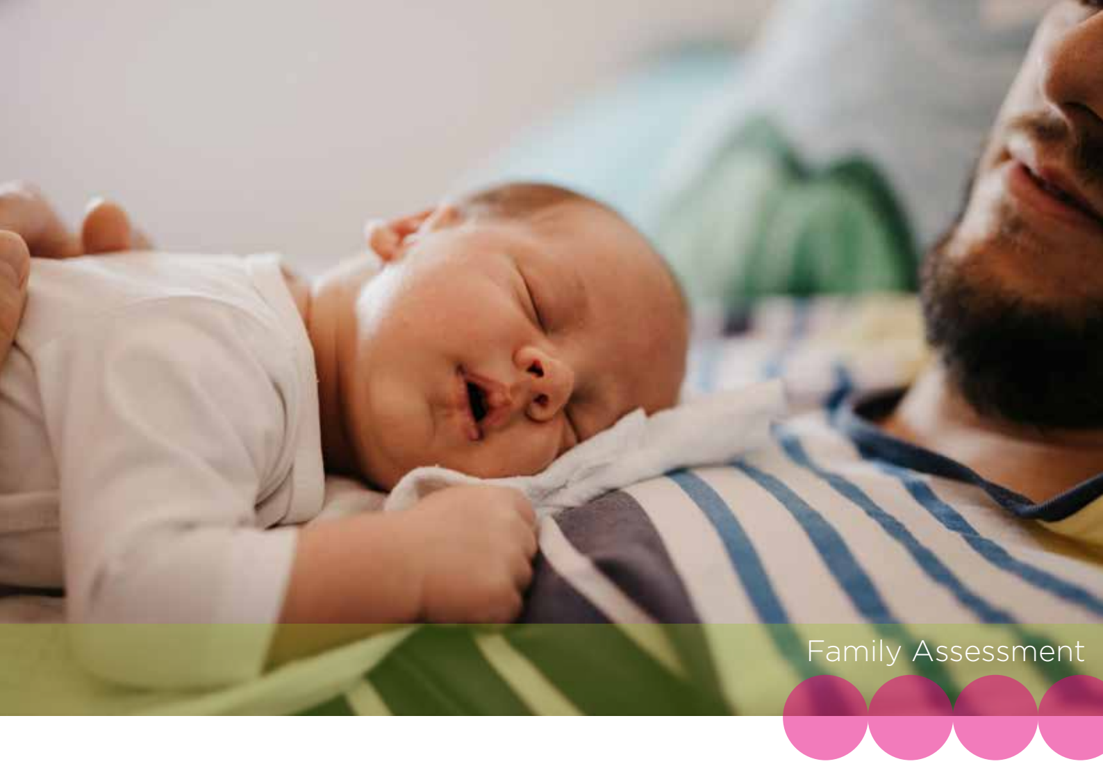
Inspiring and supporting young people to live happy, healthy and successful lives